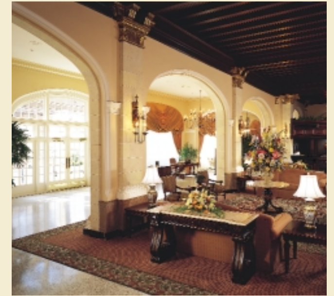
Find your own cozy spot for relaxed conversation.