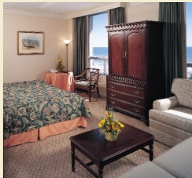
Your home away from home - complete with a breathtaking Gulf view.