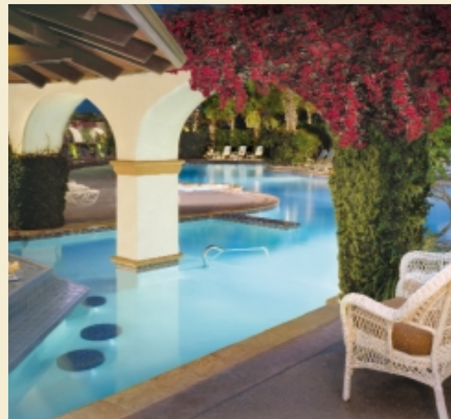
Cool, elegant, inviting - dive into our lush, landscaped pool.