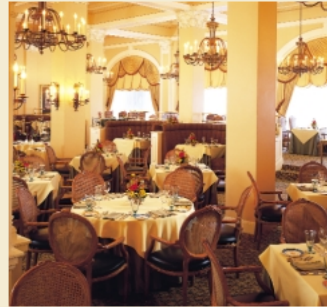
Beautiful Bernardo's Restaurant delights all the senses.