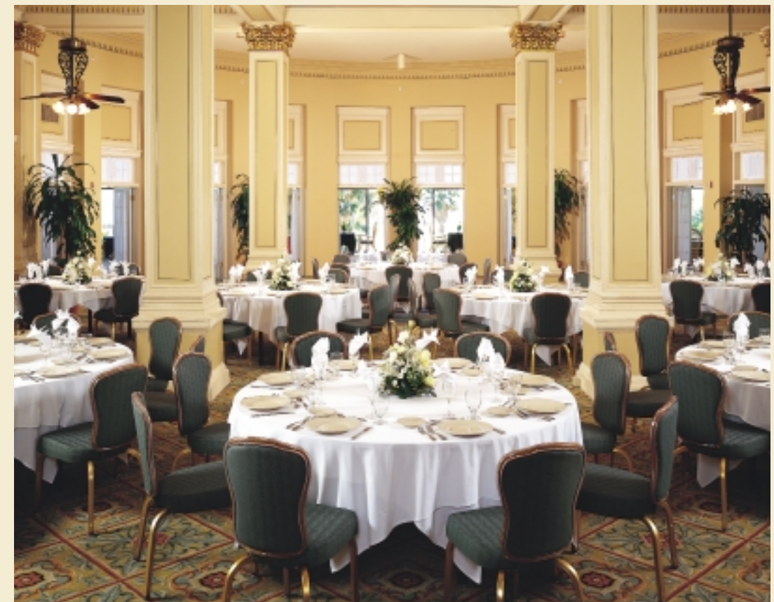
Our attentive service makes every event one to remember.