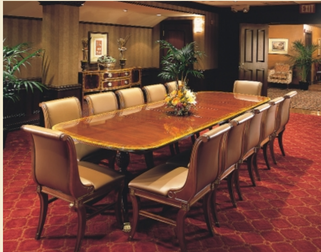
It's easy to get down to business in our beautifully appointed spaces.